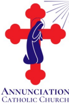
ANNUNCIATION CATHOLIC CHURCH